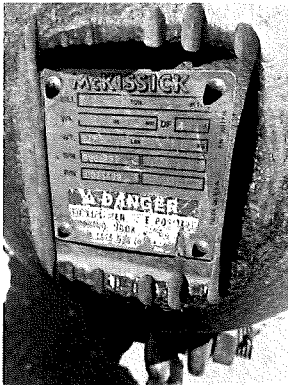
(110.A) Data Plate