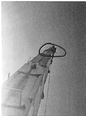
(99.A) Wear Pads